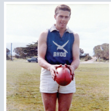
BHOG Best and Fairest 1963