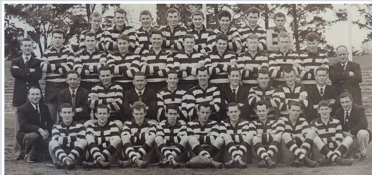
GFC Under-19 team 1960, runners-up