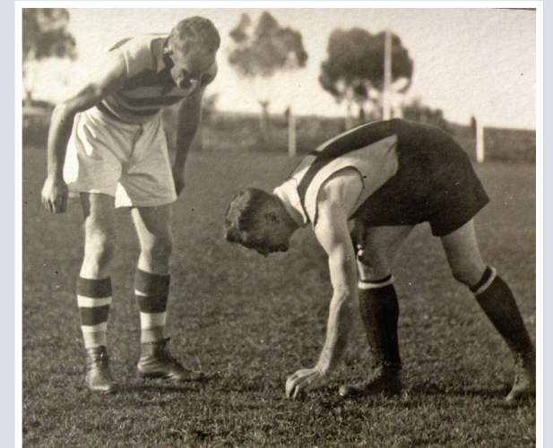
Coin Toss, 1930s